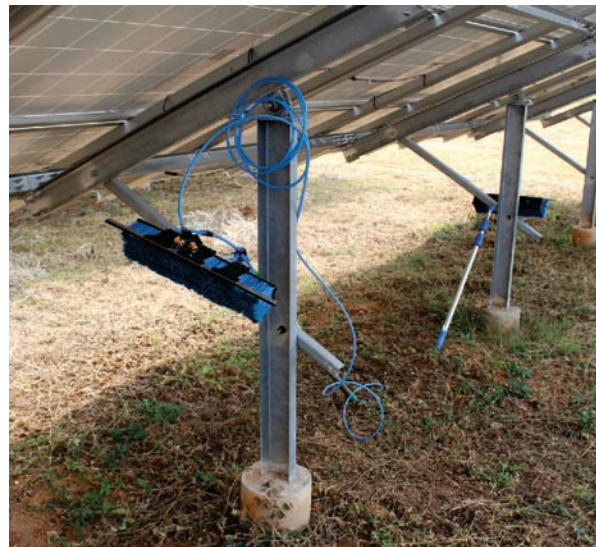
Easy to Storage