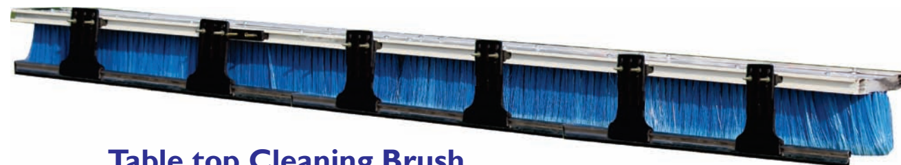
Table top Cleaning Brush